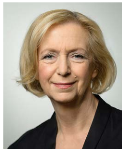
Prof. Dr. Johanna Wanka, Federal Minister of Education and Research

I look forward to many creative and innovative ideas.